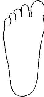
BOTTOM OF FOOT