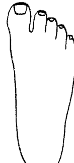
TOP OF FOOT