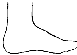
OUTSIDE OF FOOT