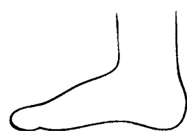
INSIDE OF FOOT

I HEREBY AUTHORIZE FOOT & ANKLE ASSOCIATES, LTD. TO TREAT ME IN ANY WAY THAT IS APPROPRIATE AND TO FURNISH INFORMATION TO MY INSURANCE CARRIER CONCERNING MY ILLNESS AND TREATMENT. TO THE BEST OF MY KNOWLEDGE, I HAVE ANSWERED THE QUESTIONS ON THIS FORM ACCURATELY. I UNDERSTAND THAT PROVIDING INCORRECT INFORMATION CAN BE DANGEROUS TO MY HEALTH. I UNDERSTAND THAT IT IS MY RESPONSIBILITY TO INFORM THE DOCTOR AND OFFICE STAFF OF ANY CHANGES IN MY MEDICAL STATUS. I HEREBY ASSIGN TO THE PHYSICIAN ALL PAYMENTS FOR MEDICAL SERVICES RENDERED TO ME AND MY DEPENDENTS. I UNDERSTAND THAT I AM RESPONSIBLE FOR ANY MEDICAL BILLS NOT PAID BY MY INSURANCE CARRIER.