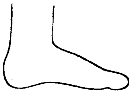
INSIDE OF FOOT